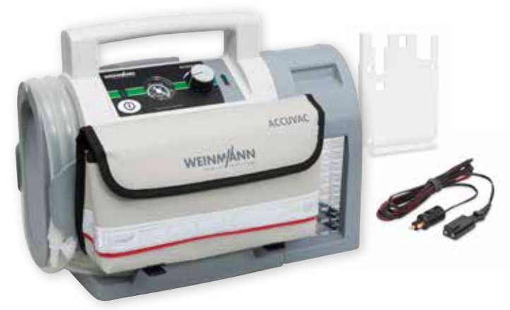
ACCUVAC Lite with reusable canister system, wall mounting, accessories bag and 12-V connection cable, WM 11720

ACCUVAC Lite with disposable canister system, wall mounting and 12-V connection cable, WM 11715 and protective bag, WM 11692