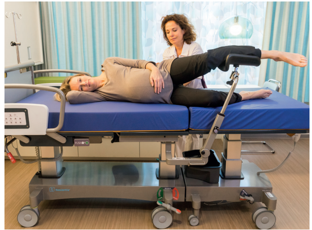
2. Side Lying