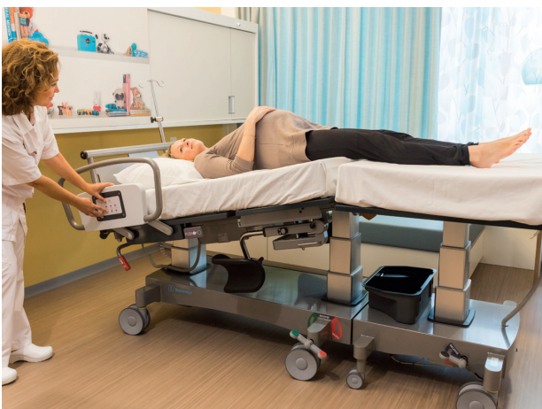
5. Trendelenburg position