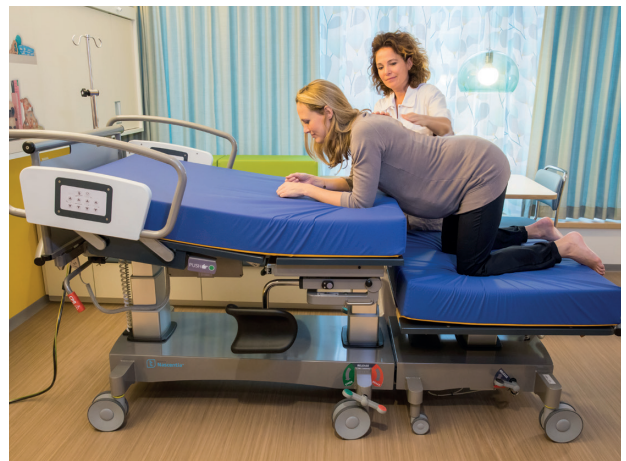
4. Kneeling birth position