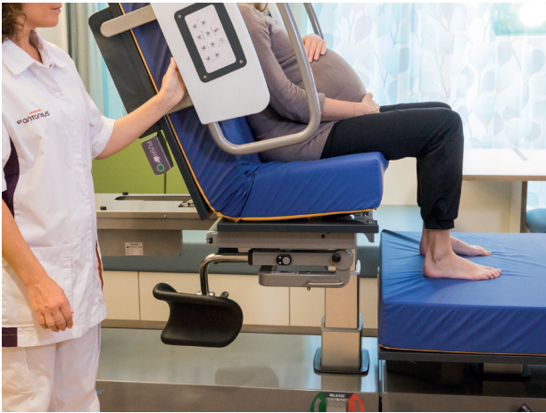
1. Throne position