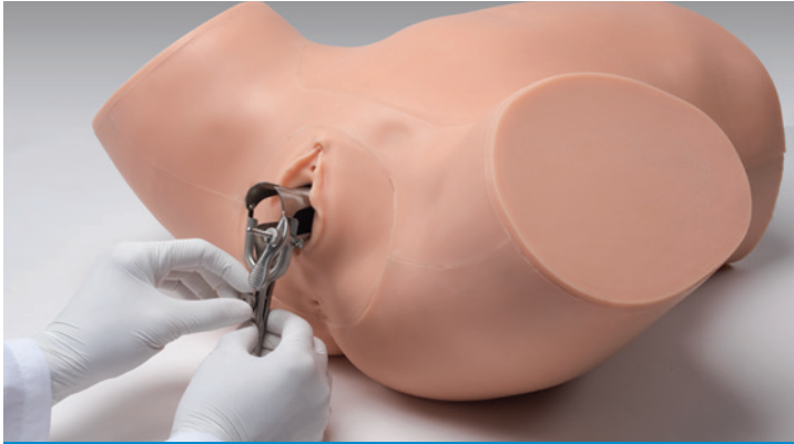
ZOE® Gynecologic Skills Trainer