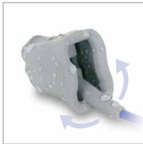
2. clean inside