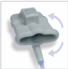
1. turn inside out