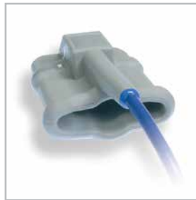
3. turn back